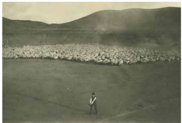
Sheep and Baseball, Grant County Museum.

Washington Rural Heritage recently celebrated its fifth year of service to small public and tribal libraries throughout the state. Managed by the Washington State Library , the collaborative digitization project aggregates local history resources from more than eighty cultural institutions (including thirty libraries) and two hundred private collections. According to staff at the Connell branch of Mid-Columbia Libraries , which recently completed a 2011–2012 WRH grant project: "Images of our community that had been forgotten are now available for all to see! This project has allowed us to provide better service to our customers." In 2013, five new collections will be added to the repository.