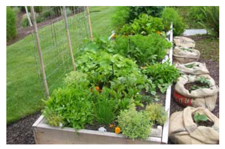
The Woodmont Library garden

The Woodmont Library garden is being used in conjunction with children's programming throughout the year. Garden activities are integrated into both the preschool and family story times, and each month through the end of October, there is a garden program highlighting concepts of stewardship, nature, community, and nutrition.