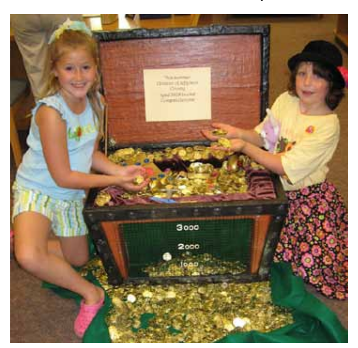
Coins representing books read by SRP participants