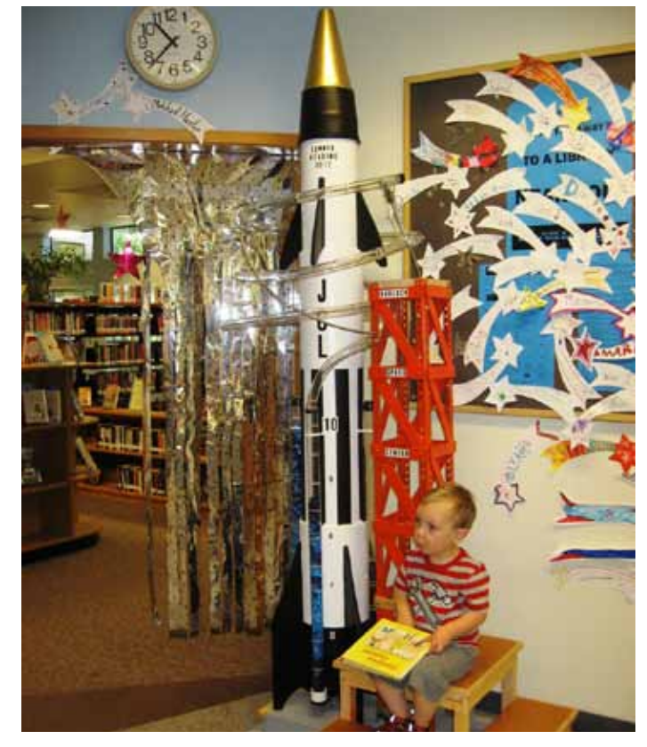
"Out of This World" rocketship