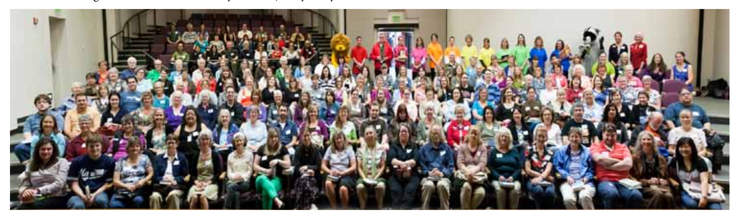
Staff day participants

Lessons learned? Our patrons often don't know, or don't understand, that we are two different library systems because workflow between us is fairly seamless: we are the ones who want to understand our differences and our similarities. How do we each process requests? How do we each develop our collections? Who does what at each library? What are the library and technology trends influencing how we will work together in the future? Having a chance to share experiences brings us closer together as colleagues and as people who truly care about our users. We strive to build community and foster learning by starting at our own door, building our own library community, workshop by workshop, discussion by discussion. And our libraries truly are better together.