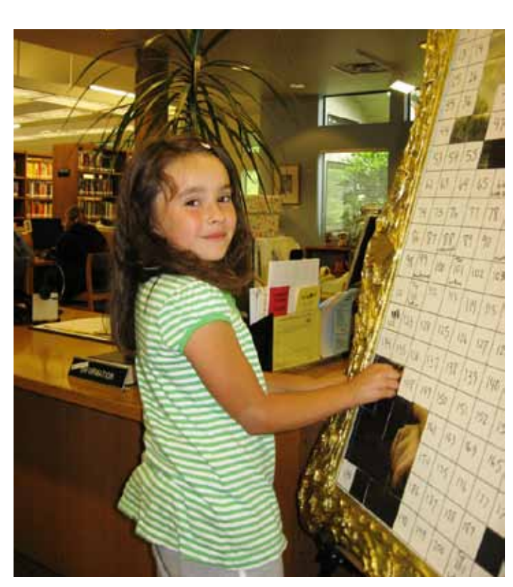
Masterpiece in progress