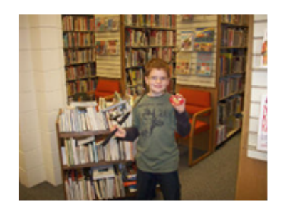
Checking out a fishing rod.

Kenai Community Library and the Soldotna Public Library, Alaska