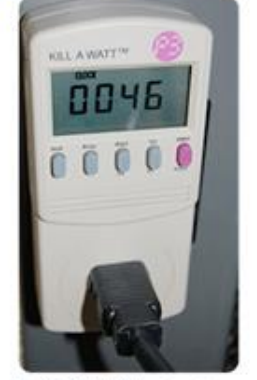
The Kill A Watt<sup>TM</sup> displays a bevy of information such as kwhs used, plug-in time, voltage, current, watts and more.

How Many Kilowatts Doesit Take to Read a Book?