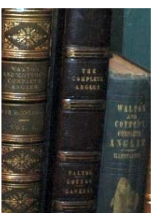
exhibit explores the ways in which The Compleat Angler was produced to appeal to a broad