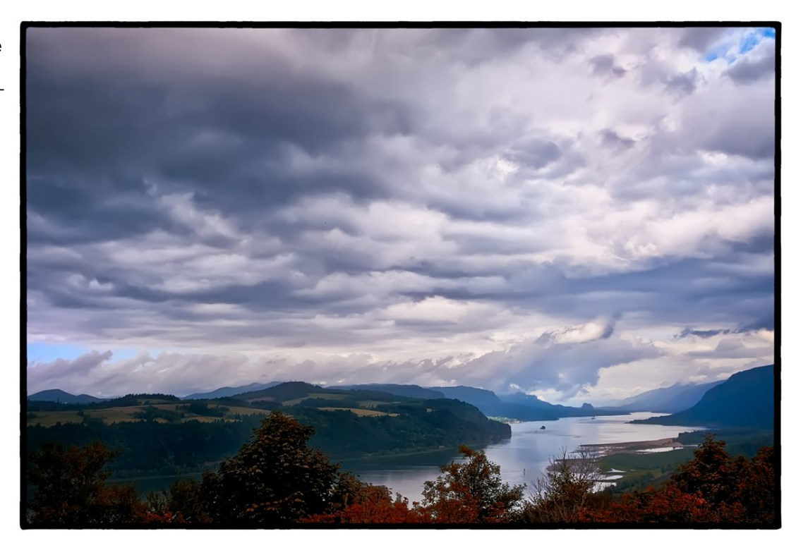
View of Columbia River Gorge from Menucha Conference Center

become diluted. Since that retreat. I've had the opportunity to bring back news of the conference to the rest of my colleagues, who were unable to attend. Each one had different interests, but we eagerly passed around my notes and the handouts I had received so that each of us could have a chance to learn something from the conference, even if not all of us could attend. It was definitely a worthwhile experience, and I am thankful for having received the scholarship, which gave me the opportunity to explore a new conference.