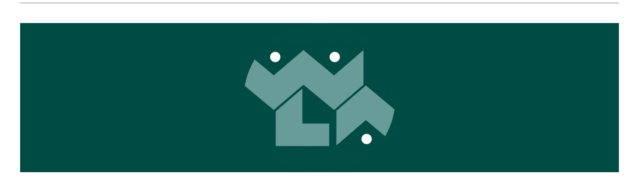
Share Your Story Today!

For inspiration, check out <u>past issues of Alki </u>, especially the summer issues devoted to the conference.