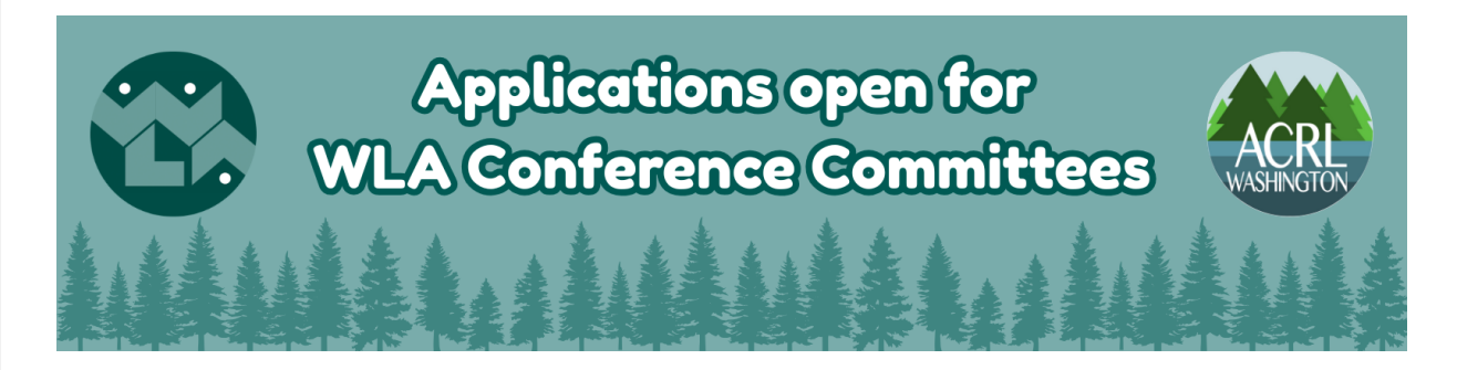
Apply for a WLA Conference Committee!

Please <u>fill out this form</u> if you are interested. Responses are due by Wednesday , April 30 .