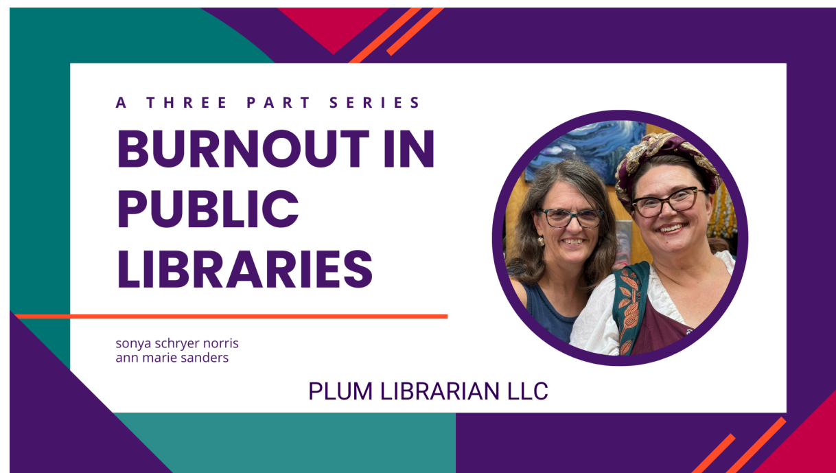
Burnout in Public Libraries: A Three-Part Series